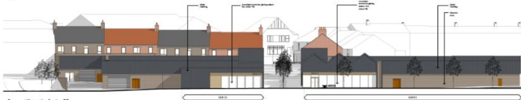
Proposed Illustrative Section DD