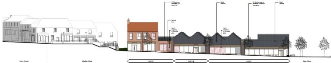
Proposed Illustrative Section CC