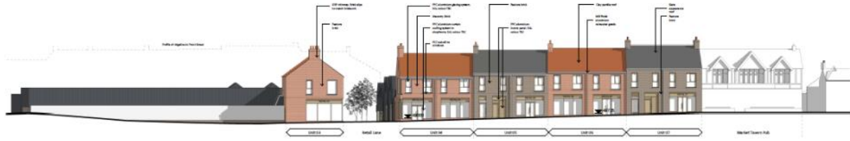
Proposed Illustrative Section AA