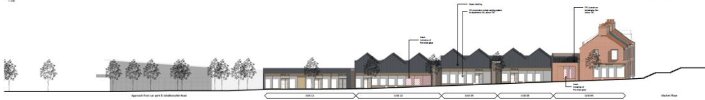
Proposed Illustrative Section BB